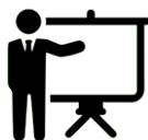
Proposals and Themes